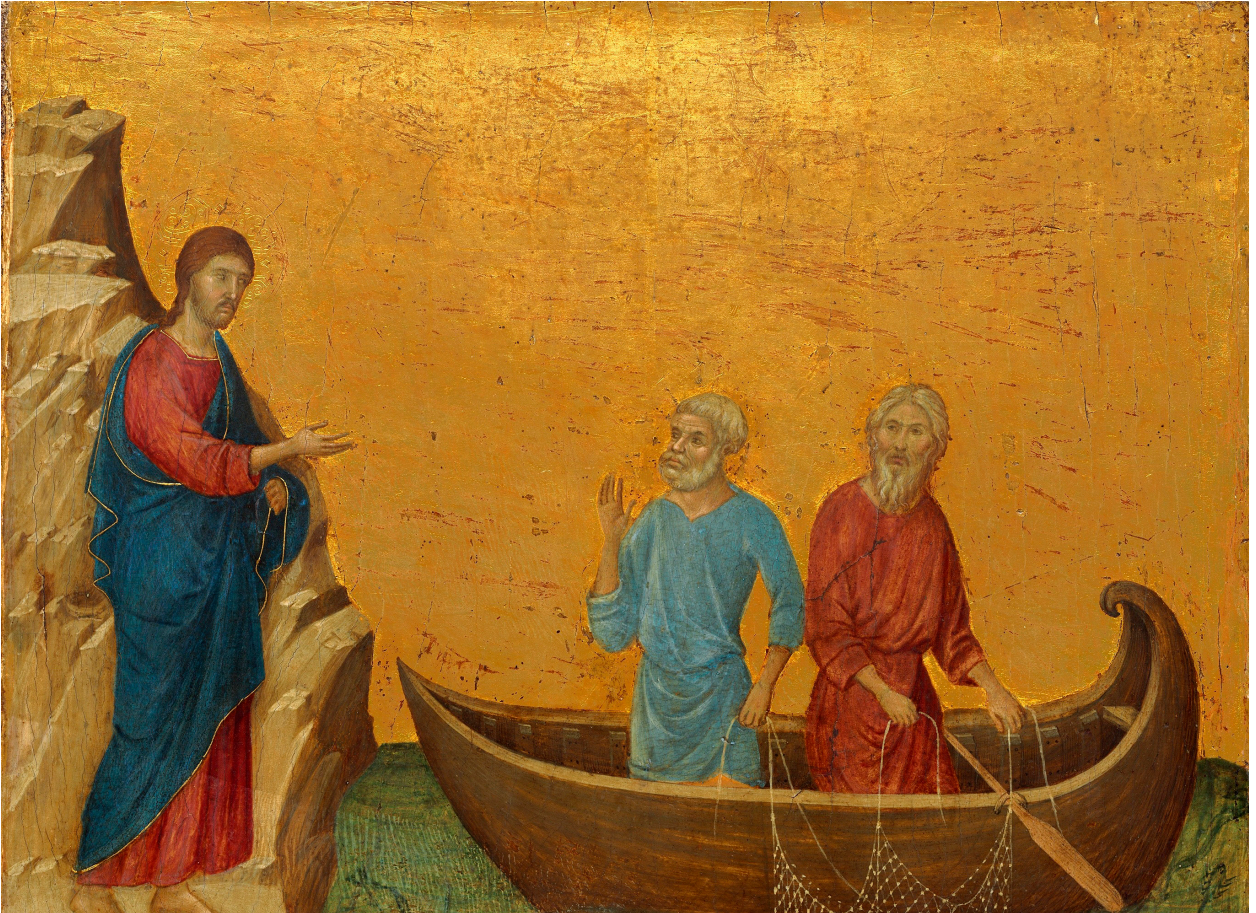
The Calling of the Apostles Peter and Andrew (1308-1311) Duccio di Buoninsegna (1255-1319)

Duccio's grand altarpiece for Siena's cathedral includes numerous small scenes with gold backdrop. Although they seem very Byzantine at first glance, being painted in egg tempera with gold leaf, Duccio has begun to depict faces and bodies in a more naturalistic way, even going so far as to allow the halos of these saints to blend into the background with just a hint of texture.